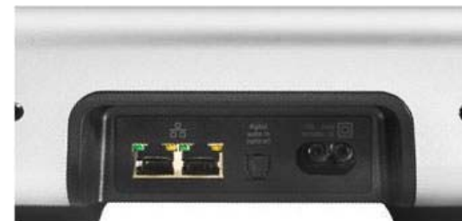
Ethernet ports (2) Digital audio in (optical) 100-240V Power